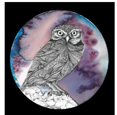
The wise old Owl